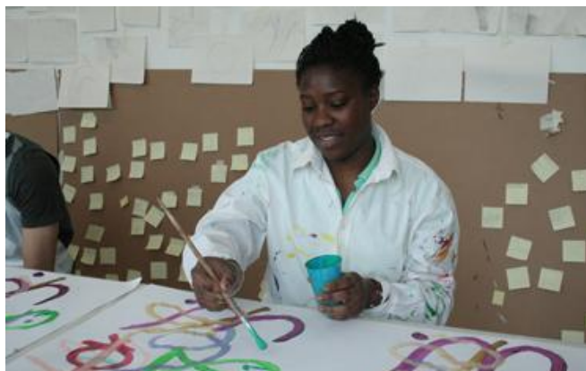
Leader of HART CULTURE C.I.C. Foundation at the Serpentine Gallery, Royal Borough of Kensington.

For larger outdoor murals that require specialist paint, we usually buy these in the 'overall budget'.