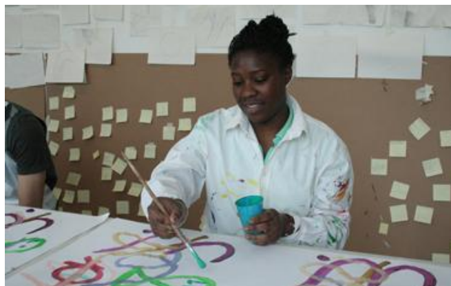
Leader of HART CULTURE C.I.C. Foundation at the Serpentine Gallery, Royal Borough of Kensington.

For larger outdoor murals that require specialist paint, we usually buy these in the 'overall budget'.