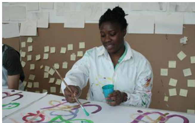
Leader of HART CULTURE C.I.C. Foundation at the Serpentine Gallery, Royal Borough of Kensington.

For larger outdoor murals that require specialist paint, we usually buy these in the 'overall budget'.