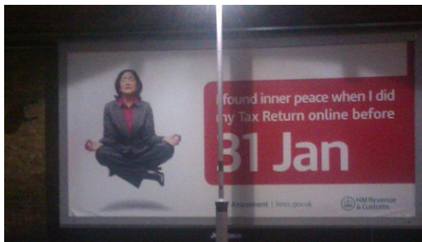
Local Authorities interpretation and participation in the Golden Era on the Commercial platform. December 2012.

From this 2014 Casestudy, we can now conclude that 75% majority of the worlds Organisations and Commercial 'Enterprises' understand 'Fully' what the 'Golden Era' is all about through their exhibition of it 'detest' and 'jokes'. This means, that we should not expect 'funding' to be our source for 'growth' any longer by 2016, however spiritual 'capital' to drive and build communities.