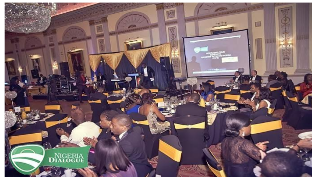
Resource material produced during 2012 – 2013 has been successful to celebrate and raise awareness about the 2012 Alignment and Golden Era. HC Publishing, 2012. [Photographed here] Nigerian Dialogue, Paradigm Shift

Other channels include Radio & Live Broadcasting.