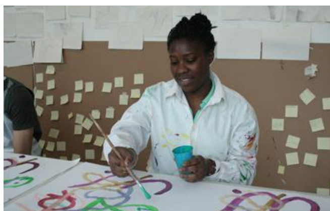
Leader of HART CULTURE C.I.C. Foundation at the Serpentine Gallery, Royal Borough of Kensington.

For larger outdoor murals that require specialist paint, we usually buy these in the 'overall budget'.