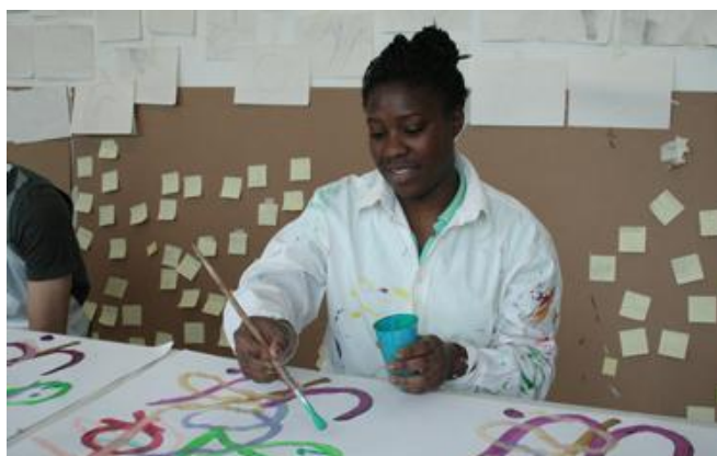
Leader of HART CULTURE C.I.C. Foundation at the Serpentine Gallery, Royal Borough of Kensington.

For larger outdoor murals that require specialist paint, we usually buy these in the 'overall budget'.